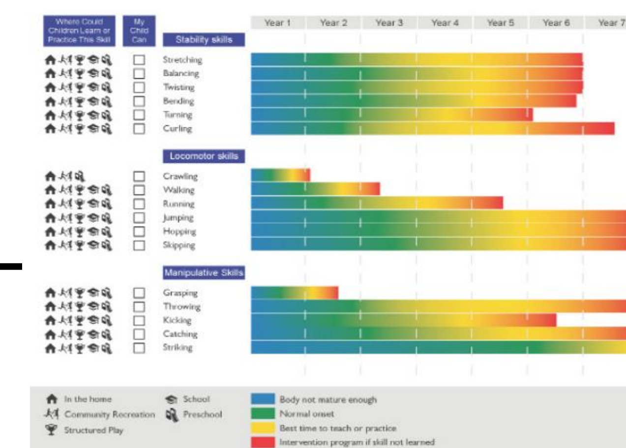
FIGURE 1. Fundamental Movement Skills (FMS) Chart