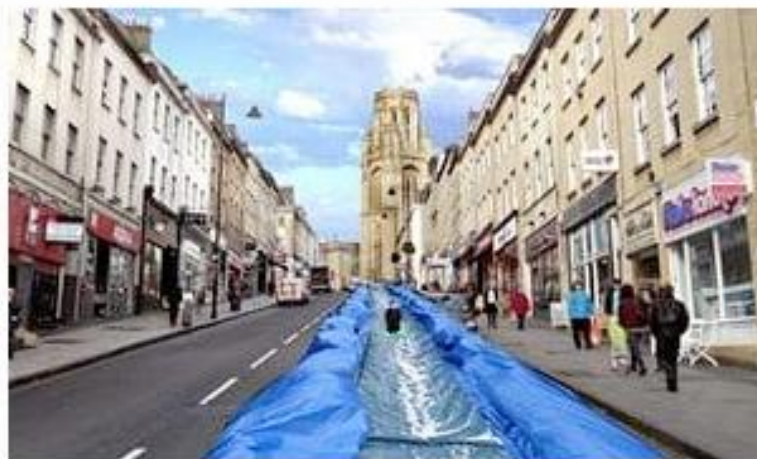
Mock up of the Park and Slide project for Bristol