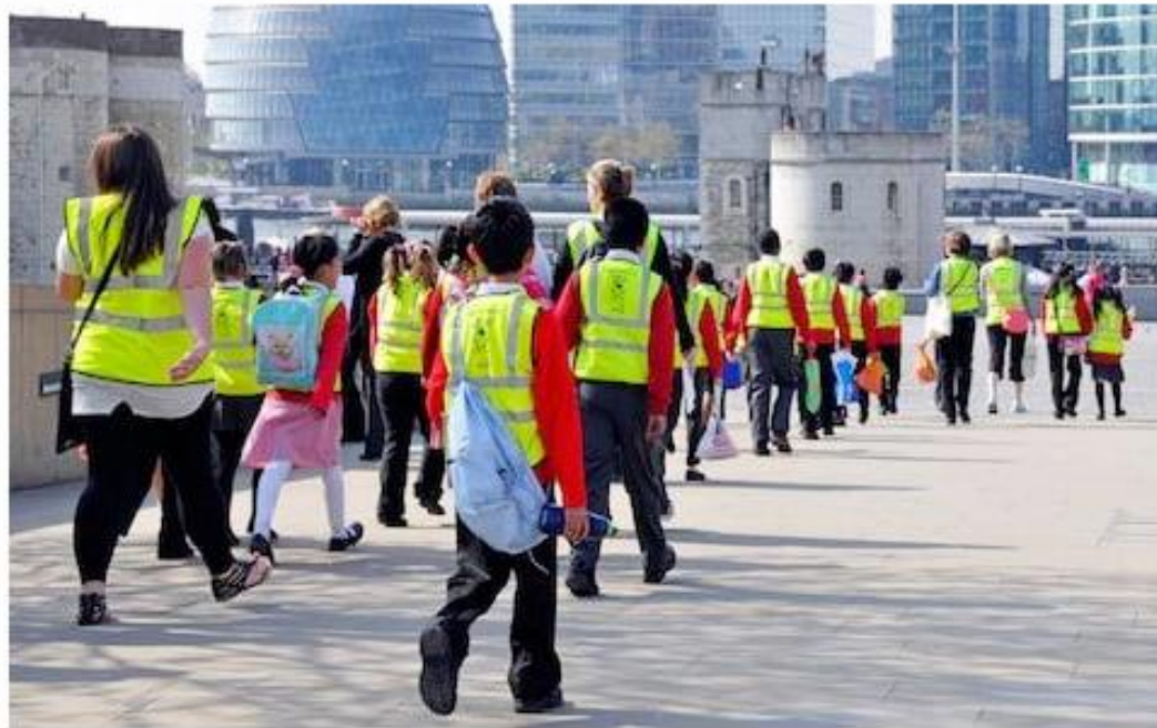
School trip pupils and adults wearing high visibility jackets on visit to The Tower of London